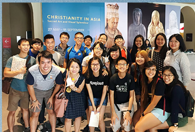
Covenant Keepers outing to the Asian Civilisations Museum for an exhibition on "Christianity in Asia"