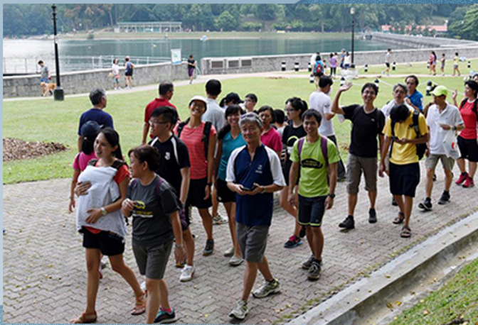
CERC had a National Day hike at MacRitchie Reservoir