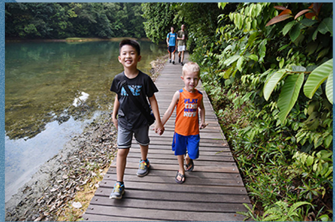
Two of our younger members on the trail!