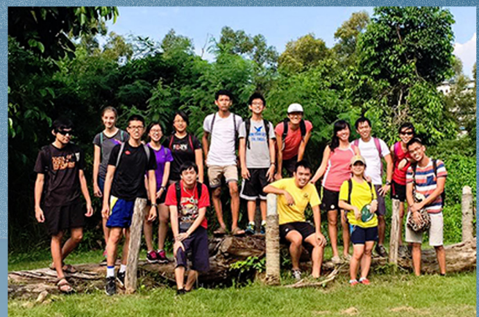
Another Covenant Keepers outing - this time to Tampines Eco Park