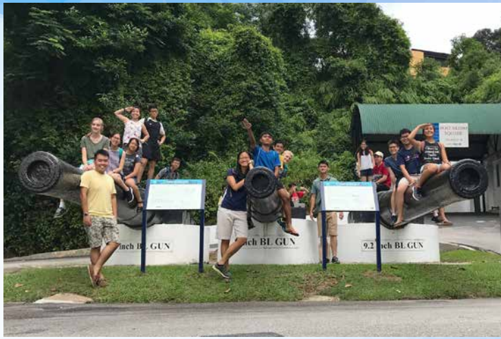
Covenant Keepers outing to Fort Siloso