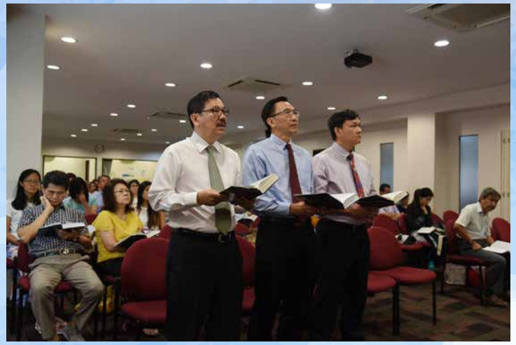
Ordination of 2 elders and 1 deacon