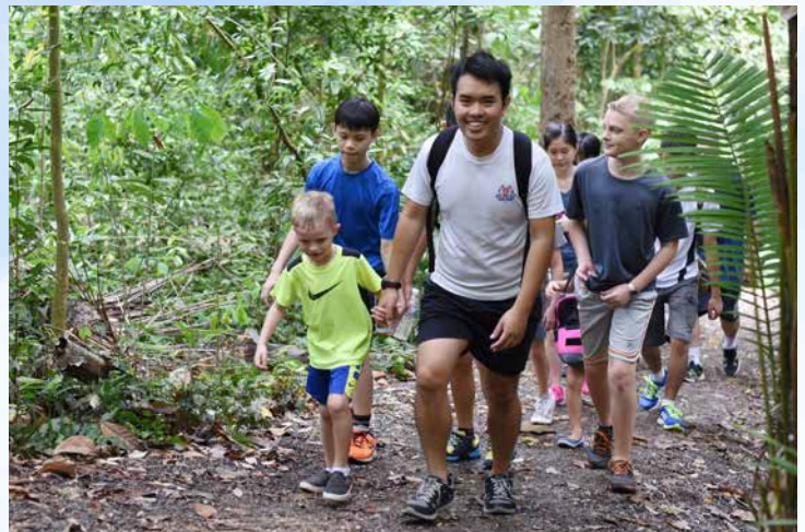
A nature walk for National Day Outing