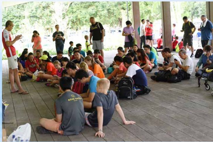
Exhortation during National Day Outing