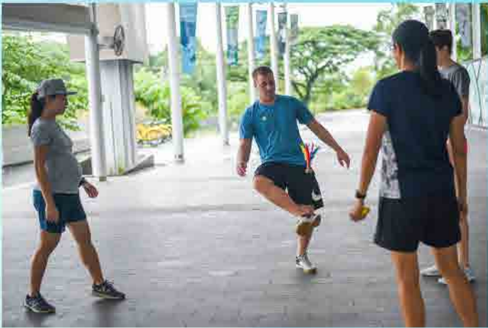
Trying out Singapore sports - chapteh