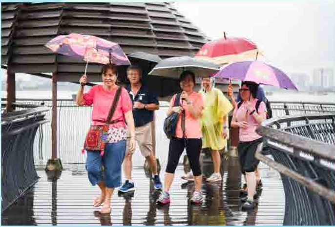
At Sungei Buloh Wetland Reserve for CERC's New Year's Day church outing