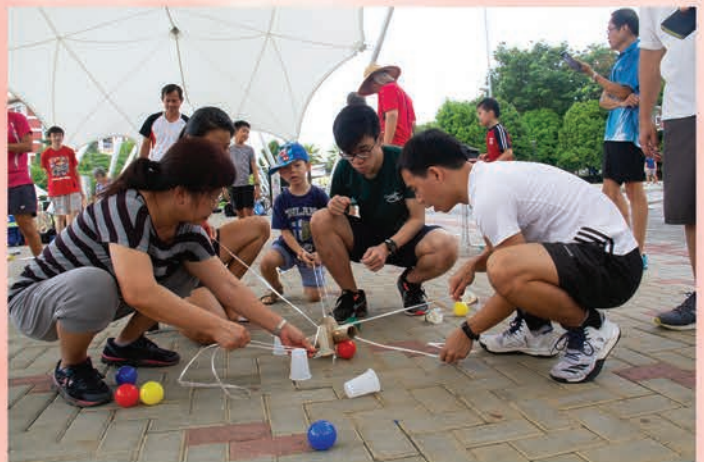
Team games at CERC's "Old School Sports Day"